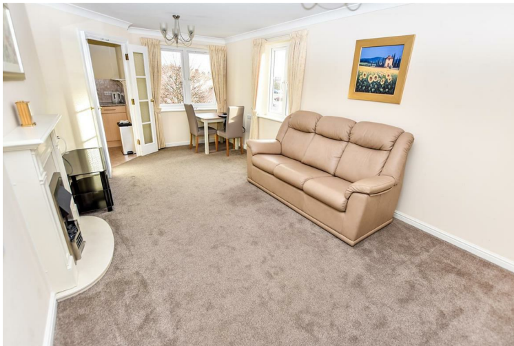
Lounge/Diner 19'7 x 10'7 (5.97m x 3.23m)

A bright and spacious room with windows to both front and flank, coved and skimmed ceiling, dimplex heater, feature mock fireplace, panelled glazed double doors to kitchen