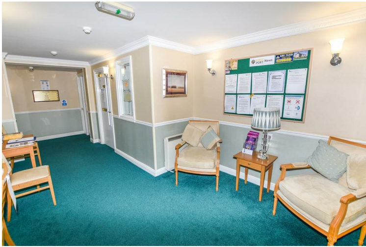
Communal entrance hall