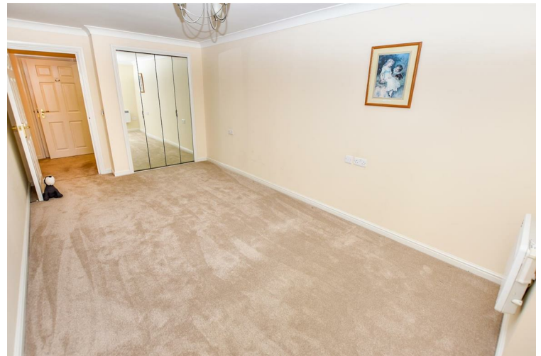
Bedroom one 17'3 plus wardrobes x 9'7 (5.26m plus wardrobes x 2.92m)

Window to front, dimplex heater, coved and skimmed ceiling, recently built in mirror fronted wardrobes.